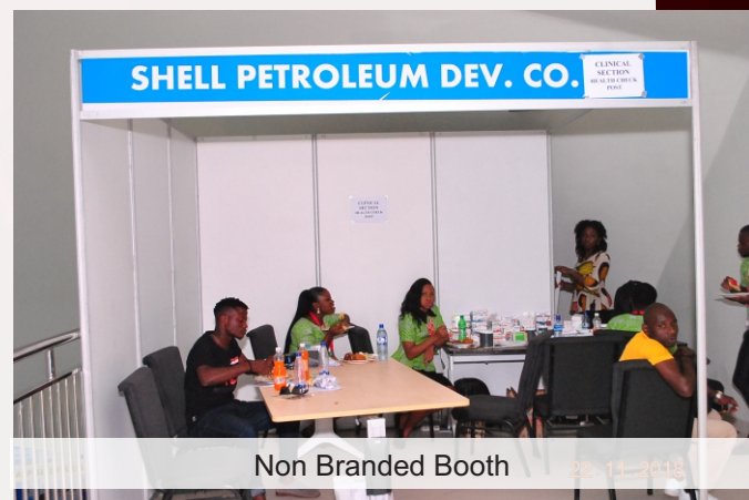
Non Branded Booth